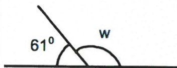
Diagram not drawn accurately